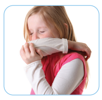
Cover your mouth when you sneeze or cough