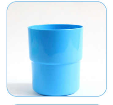
Use your own cups and utensils